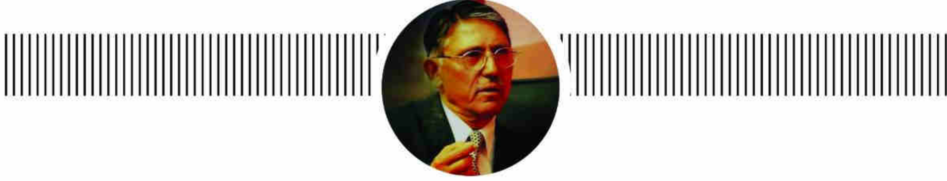
By Brij Khandelwal

When the EVMS spoke, PK's revolution evaporat-