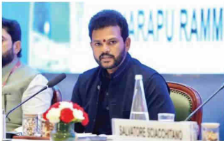
Union Civil Aviation Minister K Ram Mohan Naidu

To run a plane, one needs an aircraft in a proper schedule, you will need at least 10 to 15 pilots per