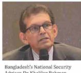
Bangladesh's National Security Adviser, Dr. Khalilur Rahman

Hosted by India's NSA Ajit Doval from November 19-20, the seventh CSC meeting brings together security chiefs from Maldives, Mauri-