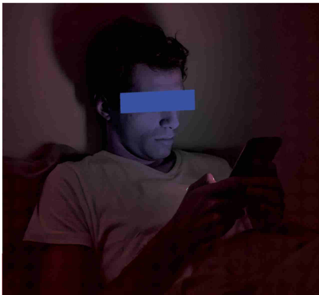
In the race for high profits, digital platforms are leaving behind art, sensitivity and social values and making obscenity the new 'entertainment' – its ill effects are deep and dangerous, especially on the psyche of the youth.

Poet, freelance journalist and columnist, All India Radio and TV panelist