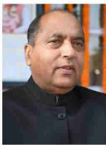
Thakur highlighted the case of the state's second Sardar Vallabhbhai Patel University, which was established during the previous government's tenure.