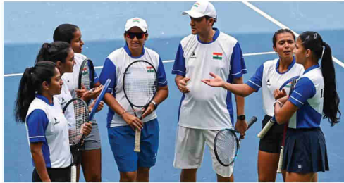
and the Netherlands.

The Indian team will have their task cut out when they take on Slovenia