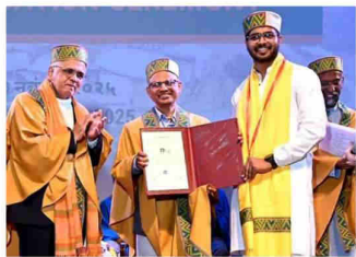
Over 25% of graduates are women; institute to mark 15th year as 'Homecoming' for first batch