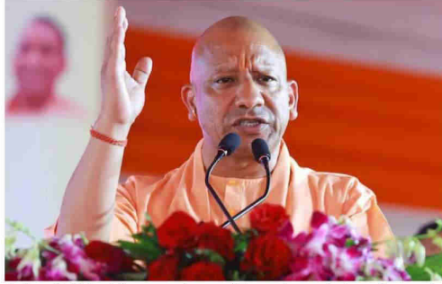
Saturation-based growth in 517 tribal villages under the Dharti Aaba campaign sparks transformation