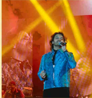
The highlights of the fest included stellar live per-

The event featured an impressive line-up of cultural performances, inter-college competitions, and musical evenings that drew enthusiastic participation from students and guests alike.