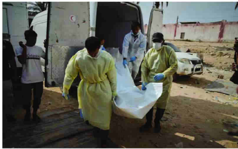
The exchange marked another step forward for the tenuous, US-brokered truce. As part of the deal, Israel has returned the remains of 15 Palestinians for each Israeli hostage.

Arrests and detentions of Afghan nationals in Pakistan surged by 146 per cent in the week ending November 1, driven largely by the reopening of border crossings, according to a UN report.