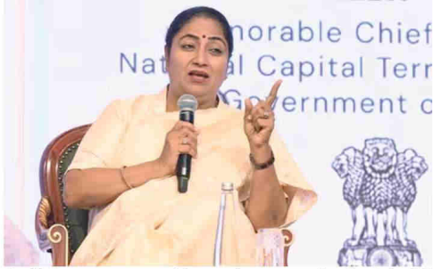
Honorable Chief Minister Rekha Gupta, National Capital Territory Government of Delhi, is seen addressing a press conference. She is wearing a yellow sari and speaking into a microphone. Behind her is a banner with the Delhi Government logo and the text 'Honorable Chief Minister National Capital Territory Government of Delhi'.

New Delhi Delhi Chief Minister Rekha Gupta has directed DUISIB to conduct a survey in slum areas to identify families still using traditional stoves and hearths, so that clean fuel can be provided to them under the Ujjwala Yojana, according to the Delhi CMO. She stated that the government's goal is to ensure access to clean energy for every family in slum settlements, reducing both pollution and health risks, as stated in the CMO. The Chief Minister also clarified that such families will be given priority for gas connections so that no one has to depend on tradi-