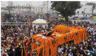
place where Guru Nanak was born.

Lahore: As many as 2,150 Indian Sikhs are expected to arrive at Lahore via Wagah border to take part in festivities related to the 560th birth anniversary of Guru Nanak Dev on November 5, a top official said Sunday.