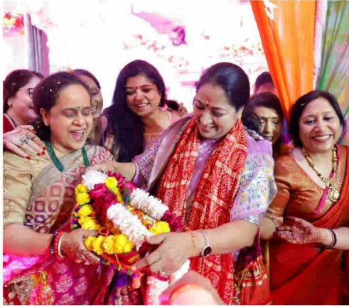
CM Gupta says religious events inspire devotion and wisdom in life