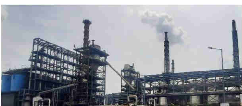
dle East. CTP is used to manufacture carbon anodes and cathodes for aluminium smelting and for EV batteries.