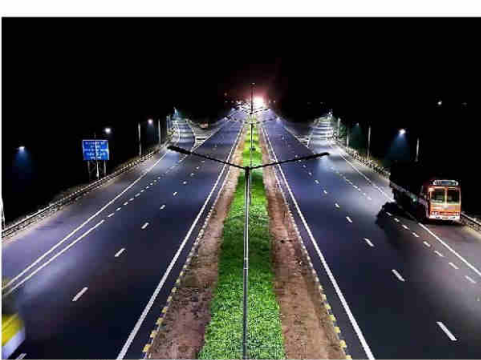
Penalty will increase to Rs 50 lakh if an accident happens next year," he added.

"If more than one accident happens in a particular stretch, say 500 meters, then the contractor will face a penalty of Rs 25 lakh.