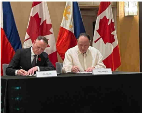
United States and other countries in the South China Sea.

Beijing claims the waterway, a major trade route, virtually in its entirety, despite a 2016 arbitration ruling that invalidated those claims based on a 1982 UN convention. China has dismissed the ruling and has employed powerful water cannons and dangerous blocking maneuvers against Philippine coast guard and other vessels, resulting in collisions and injuries to crew. Vietnam, Malaysia, Brunei and Taiwan also have been involved in the long-simmering territorial disputes.