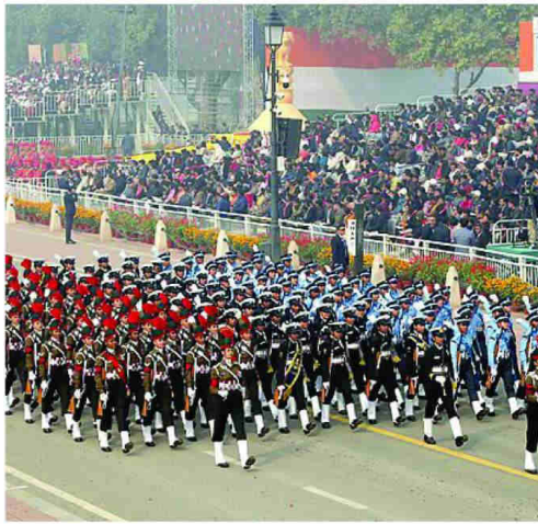
The Indian Coast Guard, Border Security Force, and several central agencies will also participate, highlighting the growing emphasis

The exercise, to be conducted in close collaboration with the Army's Southern Command and the Air Force's South Western Command, will test India's preparedness for multi-domain warfare — a complex environment where operations across land, air, sea, cyber, and space must merge seamlessly. In a rare display of inter-agency synergy,