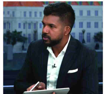
Former Indian pacer Varun Aaron

Speaking during the "Cricket Live" programme after the match, Aaron said about Sundar's knock, "Washington has demonstrated his effectiveness with the bat, especially against short-pitched deliveries, as we saw in the previous IPL. His first five boundaries off the fast bowlers were all through short balls, showing how well he thrives on them. Australia likely underestimated his capability to play the short ball, and his early six off Nathan Ellis set the tone perfectly. Though he did not bowl in this match, his