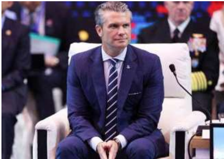
US urges ASEAN to stand firm against China in South China Sea

The South China Sea remains one of Asia's most volatile flashpoints. Beijing claims almost the entire region, while ASEAN members, the Philippines, Vietnam, Malaysia and Brunei also claim ownership of coastal areas and features. The Philippines, a key US ally, has had frequent clashes with China's maritime fleet.