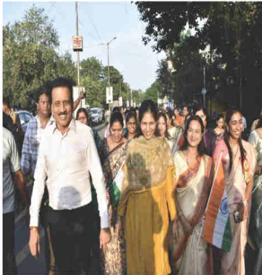
Raksha Khadse leads vibrant 'Ekta Yatra' in Maharashtra

Addressing an enthusiastic gathering at Malkapur, Khadse invoked Sardar Patel's enduring legacy, saying, "The India we are proud of today—united, strong, and