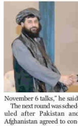
November 6 talks," he said.