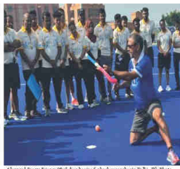
Advance Sports Science Workshop begins for hockey coaches in Delhi.