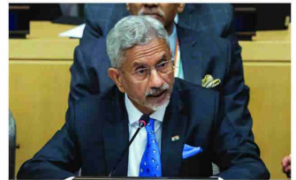
External Affairs Minister S Jaishankar

"Discussed how India and the European Union can maximize convergences and deepen cooperation. This can stabilize the global economy and strengthen democratic forces," Jaishankar said on X.