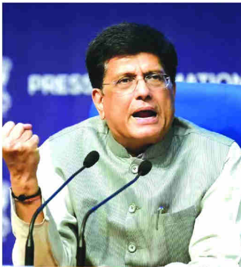
to decouple in certain sectors and certain very important subjects, from overdependence on certain geographies. And therefore India today has resolved to move away from just being the back office of

New Delhi: Commerce and Industry Minister Piyush Goyal on Wednesday said it is important for the country to have resilient supply chains, control over key technologies and reducing overdependence on certain geographies. He said the clarion call to promote swadeshi products is not just about making in India, designing or developing in India as it is key for the country's long-term growth and sovereignty. He added that reducing dependence on foreign technologies, foreign weapons, foreign energy sources and foreign critical technologies is important for the country's growth. "This decade in fact has given us several wake up calls, starting from Covid, how important is to have resilient supply chains, to have your own technologies, control over essential supplies in critical areas. "How important it is