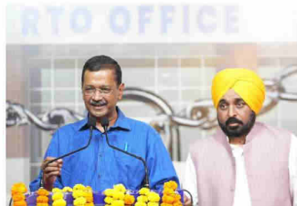
Mann put a lock at a Regional Transport Office (RTO) here as a mark of symbolism, saying the lock has been put on the "inconvenience" caused to the common man and "corruption".

The Aam Aadmi Party (AAP) supremo said people are being freed