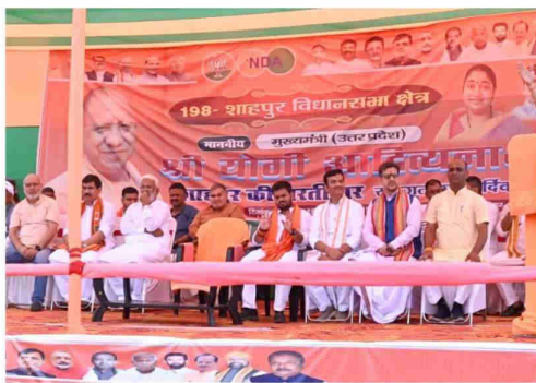
Yogi slams Lalu over stopping Advani's Ram Rath Yatra in Bihar

Siwan/Bhojpur/Buxar: Uttar Pradesh Chief Minister Yogi Adityanath on Wednesday charged RJD president Lalu Prasad with having committed a "sin" by arresting BJP patriarch Lal Krishna Advani, who had taken out the Ram Rath Yatra decades ago. The BJP leader made the remark on the campaign trail in Bihar, where he addressed three back-to-back rallies in the districts of Siwan, Bhojpur and Buxar. Without mentioning Prasad by name, the then chief minister of Bihar, Adityanath recalled the incident of 1990 in Samastipur, which the RJD supremo proudly claims while asserting his "secular" credentials. "The construction of the Ram temple at Ayodhya wiped off the blot (kalank) that had mortified the nation for 500 years. But the RJD's men had committed the sin of stopping the Rath of Lord