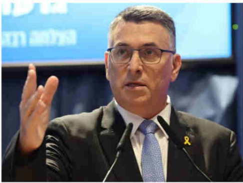
Israel FM to visit India for key talks next week

India and Israel signed a Bilateral Investment Treaty (BIT) during the visit of Finance Minister Smotrich in September to deepen economic and financial ties, and to assure investors from both sides of appropriate safeguards in light of relevant international precedents and practices.