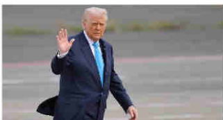
to South Korea. "I'm not allowed to run. It's too bad," The president's com-

Gyeongju: Donald Trump said Wednesday that "it's too bad" he's not allowed to run for a third term, conceding the constitutional reality even as he expressed interest in continuing to serve. "If you read it, it's pretty clear," Trump told reporters aboard Air Force One enroute from Japan