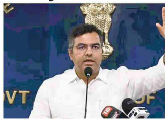
Delhi Water Minister Parvesh Verma speaking at a podium during a press conference.

The faecal coliform bacteria concentration has come down to 7,900 units per 100 millilitre at Nizamuddin this year, from 11 lakh units per