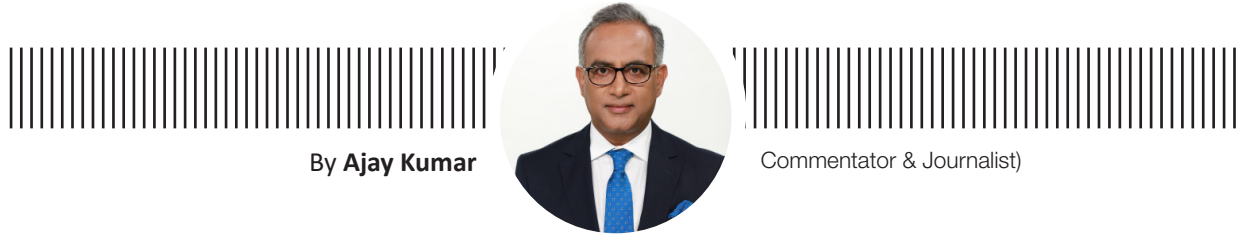
By Ajay Kumar

Given the current waveless election scenario in Bihar, one is, but reminded, of the days, Bihar had suffered some 25 years ago. There exists an all-round confusion, palpable from the various poll surveys, conducted over the past 2 weeks. Most predict a keenly fought contest, giving marginal gains to either of the alliances. Similar to 2020 polls when NDA secured about 0.05% more votes over Mahagathbandhan, the voting preferences this time around also seem, too close to call. A vast majority of voters in Bihar are still, fence sitters. The migrant workforce, consisting of over several lakhs, may exert its influence on the residents who shall vote, but this flock of migrant voters may not stay back to cast their own votes. Approximately 1.7 Cr women voters in the age bracket of 18 year to 45 years, appear to be the major voter swingers, within Bihar. They are the biggest beneficiaries of several government and opposition announced direct benefit schemes. Most of them have been loyal supporters of Nitish & Modi over the past decade, but will they continue to be so, specially after so many lip-smacking allurements from Mahagathbandhan, is yet to be affirmed. Likewise, over 2 Cr voters in the youth category, between the age group of 18 year to 30 years, are undecided, this time around. With NDA promising 5 lakh jobs every