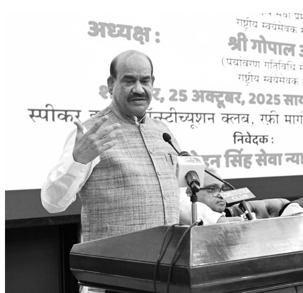
Om Birla says human actions driving ecological imbalance

Speaker recalled that when human activity paused, nature began to heal itself. Rivers became cleaner, air quality improved and wildlife flourished—"a powerful reminder of the need for sustainable living.