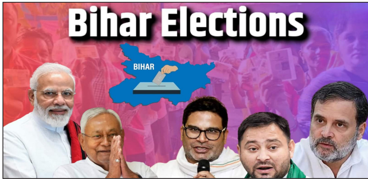
Commentator & Journalist

year, despite being in government for over 20 years and Mahagathbandhan promising 2.3 Cr jobs within 20 months of assuming power - the youth are yet to firm up their options. Poverty data, underdevelopment data, backwardness index, economic collapse - all these taken together present a very dismal picture of Bihar. Actually, the data complex for Bihar is so muddled this time that most parties are unsure of even their own voters. Overarching these complexities is the caste alliance - which has blurred to such an extent that no analyst is definitive about the caste voting patterns. Frankly, Bihar is a royal electoral mess.