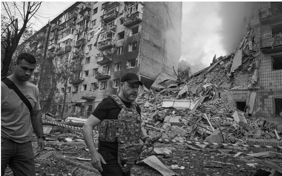
Russian missile, drone strikes kill 4 in Ukraine