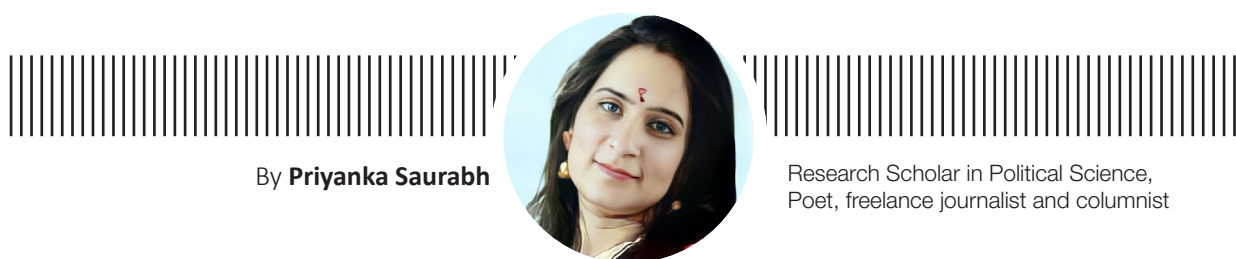
By Priyanka Saurabh

There's already an ongoing debate in India about a Uniform Civil Code. This Assam law could further intensify that debate. The government may argue that all citizens, regardless of their religion, should have the same rules. But this concept of equality is meaningful only if it is voluntary and based on consultation, not fear and control. If policies are designed to target a single community, they will lead to division