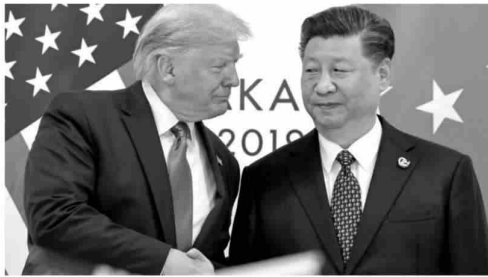
US President Donald Trump and Chinese President Xi Jinping

Beijing China on Friday confirmed that President Xi Jinping will visit South Korea to attend the APEC Summit, during which he is expected to hold crucial talks with his US counterpart Donald Trump to ease escalating trade tensions between the two countries.