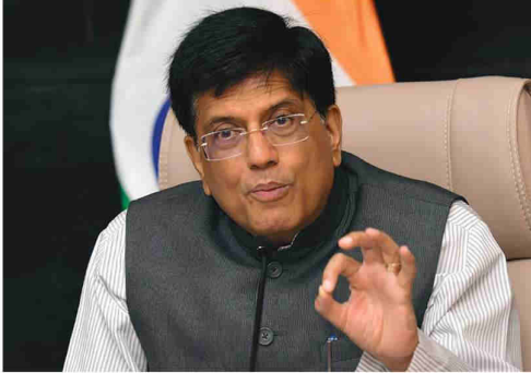
Commerce and Industry Minister Piyush Goyal