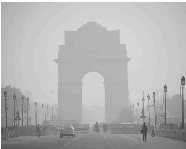
civil society, and citizens alike.

Cities like London and Beijing, once infamous as gas chambers, successfully overcame their pollution crises through strong political will and citizen cooperation, backed by long-term structural interventions. Delhi needs a similar transformation led by firm and sometimes unpopular policy decisions taken for the larger public interest. The ban on pet-