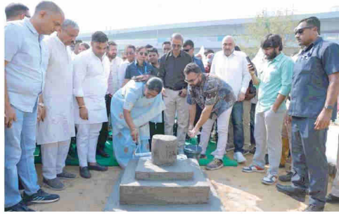
Delhi Chief Minister Rekha Gupta on Friday inspected the Chhath Puja Ghat at Pochanpur and took part in voluntary work as part of preparations for the upcoming Chhath Mahaparv.

The Chief Minister highlighted that this year's festival represents a grand celebration, integrating both devotion and convenience for the people of Delhi. Local residents and members of the Chhath Puja Committee expressed their appreciation for the governments efforts in organizing the event.