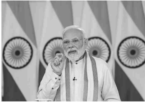
PM addressing at Rozgar Mela via video conferencing on October 24, 2025.

TSN/New Delhi Prime Minister Narendra Modi on Friday asserted that when the youth of the country succeed, then only the nation succeeds, while addressing the Rozgar Mela in the national capital via video conferencing. Speaking on the occasion, the Prime Minister remarked that this year's festival of lights, Diwali, has brought new illumination into everyone's lives. Amidst the festive celebrations, receiving appointment letters for permanent jobs adds a double dose of joy--both the cheer of the festival and the success of employment. According to the Prime Minister's Office release, PM Modi highlighted that this happiness has reached over 51,000 youth across the country today. He acknowledged the immense joy this brings to their families and extended his congratulations to all the recipients and their family members. He conveyed his best wishes for this new beginning in their lives. Highlighting the enthusiasm, capacity for hard work, and the self-confidence born from fulfilled dreams among the newly appointed youth, PM Modi remarked that when this