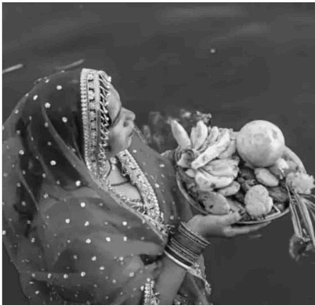
awakening — a deep connection with the cyclical rhythm of nature.

Originally rooted in Bihar, Jharkhand, and eastern Uttar Pradesh, Chhath today has crossed oceans and boundaries. It is celebrated with equal devotion in Delhi, Mumbai, Kolkata, and Bengaluru, as well as across the world — in Mauritius, Fiji, the Netherlands, Suriname, Singapore, Dubai, Muscat, England,