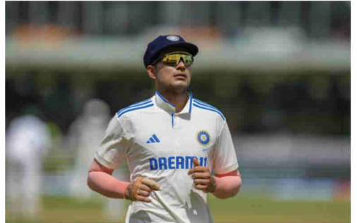
Gill happy with intent but rues missing a big knock

Speaking during the post-match presentation, Gill said the team