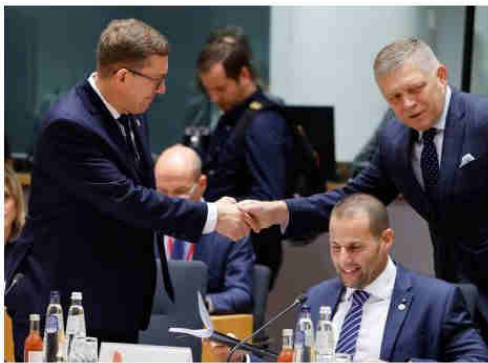
Blomberg HC to see new FTI phase on Israel's post-war rights

"It is important that Europe not only watches but plays an active role," said Luc Frieden, the prime minister of Luxembourg, as he headed into the meeting. "Gaza is not over, peace is not yet permanent," he said. Outrage over the war in Gaza has riven the 27-nation bloc and pushed relations between Israel and the EU to a historic low. European Commission