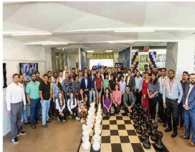
Viswanathan Anand opens Global Chess League Experience Centre in Dallas

Located at Tech Mahindra's Dallas headquarters, the space offers a panoramic view of Plano's skyline and