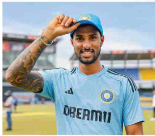
Tilak Varma aims to finish career with most ICC titles

The 22-year-old player also shared his excitement about playing at Mumbai's Wankhede Stadium, describing the electrifying atmosphere and passionate crowd. He