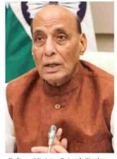
Defence Minister Rajnath Singh

For the Indian Navy, approval was granted for the procurement of Landing Platform Docks (LPDs), 30-mm Naval Surface Guns (NSGs), Advanced Lightweight Torpedoes (ALWTs), the Electro Optical Infra-Red Search and Track System and Smart Ammunition for 76-mm