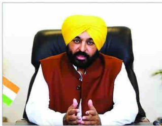
Chief Minister Bhagwant Mann

"The video was made with the sole intention of defaming our beloved chief minister and conducting character assassination," he stated. Kang claimed the video went viral, emphasising that many BJP leaders, including official party bearers and spokespersons, played significant roles in amplifying it.