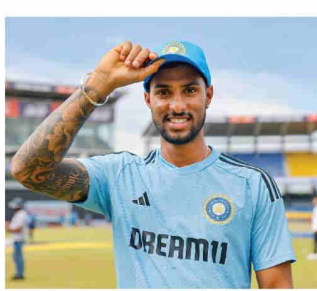
Tilak Varma aims to finish career with most ICC titles