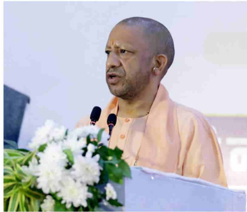
CM Yogi performs Govardhan Puja, stresses cattle care & farmer welfare

Adityanath further instructed the creation of new posts, including a district-level accounting cadre to improve administrative efficiency and financial transparency, along with additional positions at the state