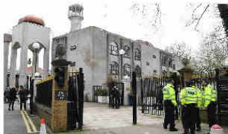
Security measures such as CCTV, alarm systems, secure fencing, and security personnel services.

London: Prime Minister Keir Starmer on Thursday announced a 10-million-pound boost to security funding for the UK's mosques and Muslim faith centres to protect them from hate crime and attacks.