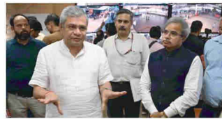
Staff Reporter New Delhi

Indian Railways has launched 12,075 special trains to help millions of passengers during the Durga Puja, Dussehra, Diwali, and Chhath festivals.