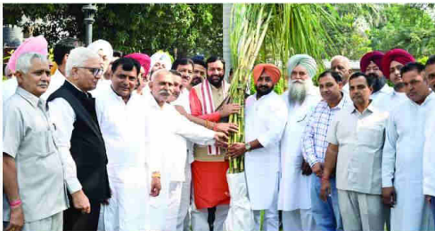
Haryana Chief Minister Sh. Nayab Singh Saini being thanked by sugarcane farmers in Chandigarh for increasing the sugarcane price.

The Chief Minister said that the price of early-variety sugarcane has been raised from ₹400 to ₹415 per quintal, and that of late-variety sugarcane from ₹393 to