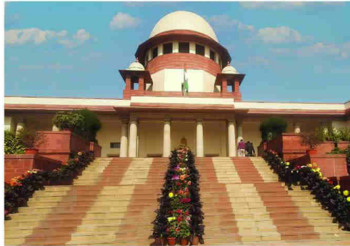
SC rules minors' conduct enough to reject unauthorised property deals

Justice Mishal observed that a minor, on attaining majority, may avoid or repudiate such a transaction, either expressly by filing a suit for the cancellation of the sale deed or impliedly by clear and unequivocal conduct such as executing a fresh sale of the same property.