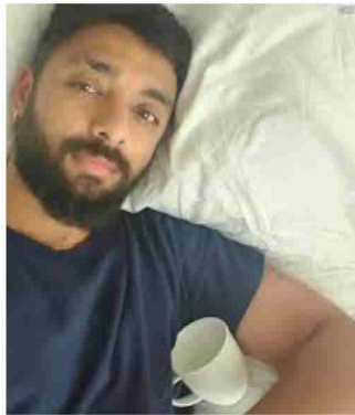
Varun Chakravarthy's sassy dig at Pakistan after Asia Cup triumph

Lodhi shared the picture and wrote: "PAF has put a mannequin of Abhi Nandhan on display in the museum. This would be a more interesting display if they could ar-