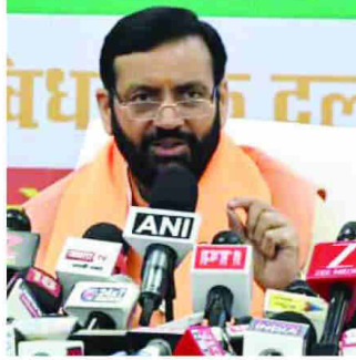
Haryana Chief Minister Naib Singh Saini

The Chief Minister outlined the three pillars of the campaign: