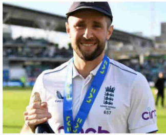
England all-rounder Chris Woakes calls time on his international cricket career

Woakes also said that making his debut against