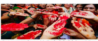
Controversy sparks over Asia Cup funds for Pahalgam victims

New Delhi: The Aam Aadmi Party (AAP) raised questions on Monday over the political messaging surrounding India's Asia Cup final against Pakistan and suggested that the revenue generated from the match could be used to support the families of the Pahalgam terror attack victims.