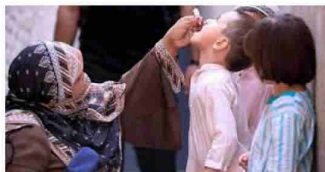
"With these two cases, both girls, the total number of polio cases in Pakistan in 2025 has reached 29," the release said.

The cases have been reported in Sindh's Badin and Thatta districts, the NIH confirmed in a press release.