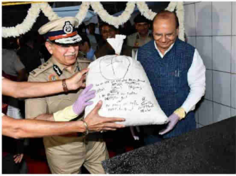
Delhi Police has launched a "Mega Drug Destruction Event" as part of their commitment to achieving a drug-free Delhi by 2027.

Staff Reporter New Delhi: Delhi Police has launched a "Mega Drug Destruction Event" as part of their commitment to achieving a drug-free Delhi by 2027. This initiative is aligned with their strong "Zero-Tolerance Policy" against narcotics, targeting drug smugglers, traffickers, and peddlers. Significant efforts have been made through operations like "Operation Kavach" and various drug detection and seizure programmes.