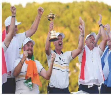
Ryder Cup stays in European hands, no matter where the venue

this week, the score will be the same over there," McIlroy couldn't help but think of those predictions as Europe celebrated its second straight win since that beating, hanging on for a