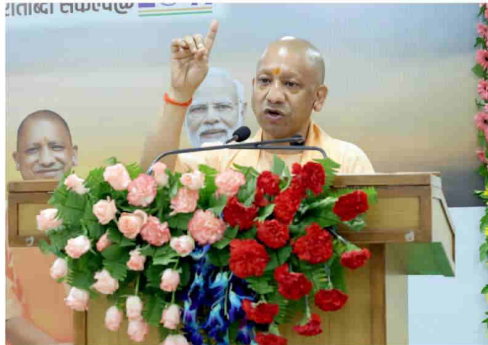
CM Adityanath urges ULBs to work towards Viksit Bharat 2047

He also underlined that urban development should not be confined to infrastructure alone, and must involve the evolution of every city into a model of smart services, green spaces,