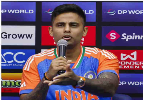
Asia Cup is one of the toughest tournaments: Suryakumar

The tournament was played after the Pahalgaon terror attack in April and the consequent launch of Operation Sindoore by the Indian Armed Forces against Pakistan-sponsored terrorism. Controversies followed right from the first match, when skipper Surya and Shivam Dube refused