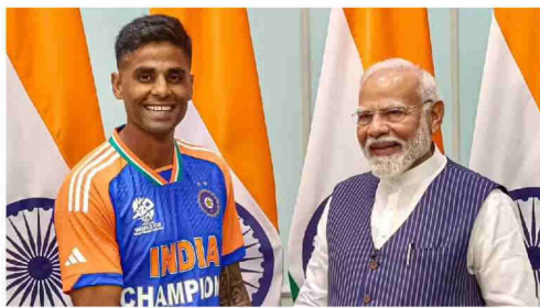
Suryakumar Yadav hails PM Modi's 'front foot' gesture after Asia Cup triumph

After India won the Asia Cup final against Pakistan with a score of 150/5 against Pakistan's 146/10, PM Modi, in a post on X, referenced "Operation Sindoore on the games field", likening India's win to the military operation launched in response to the Pahalgaon terror attack.