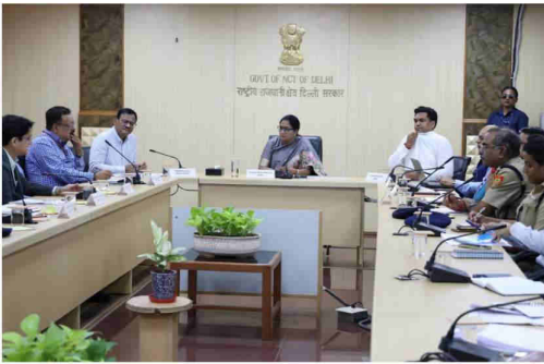
Delhi to host grand Chhath Puja along Yamuna, says CM Gupta

Chief Minister Gupta held a high-level meeting