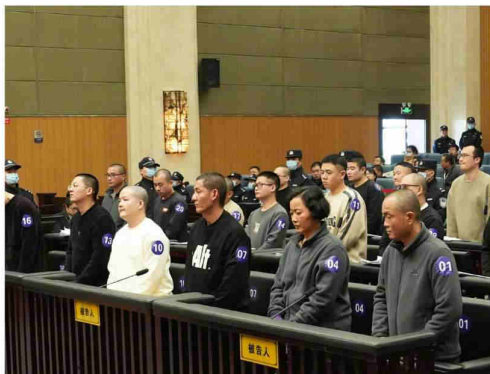
China court sentences 11 Myanmar-based gang members to death

Five others received death sentences with a two-year reprieve, and 11 were given life imprisonment.