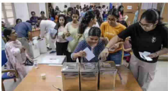
DU police review 2025 student union elections

New Delhi: Delhi University administration and police officials on Monday reviewed the recently concluded students' union polls, highlighting experiences and lessons learned for future elections.