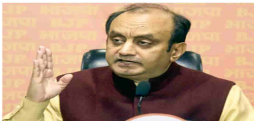
International diplomacy or the sports field. "Keep sports separate from politics," the BJP leader told the Congress. "Don't cast a shadow over the stunning performance of the Indian cricketers for whatever frustration, jealousy, hatred or inferiority complex you may have towards Prime Minister Narendra Modi," he added.

He said this clearly shows that the Congress is ready to support all kinds of propaganda in favour of Pakistan, be it