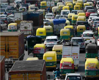
Heavy traffic congestion was reported in several parts of south Delhi on Sunday, leaving commuters stuck in a jam for hours.

New Delhi: Heavy traffic congestion was reported in several parts of south Delhi on Sunday, leaving commuters stuck in a jam for hours. Police said the traffic volume has seen a spike due to the ongoing festive season rush, which included devotees making their way to Durga Puja pandals. The affected areas included Chittaranjan Park, Lajpat Nagar, Kalkaji Road, ITO and stretches along the Outer Ring Road.