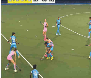
Indian Junior Women's Hockey edge past Australia U21 with 1-0 win

India will next play two matches against Canberra Chill, a club competing in Australia's premier Hockey One League, on September 30th and October 2nd to conclude their Aus-