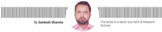
By Santosh Sharma

For teachers, AI presents a powerful means of reducing administrative burdens and enhancing instructional effectiveness. According to UDISE (Unified District Information System for Education) 2024-25, India has over 100,000 single-teacher schools, where educators often manage multiple grades and subjects while juggling