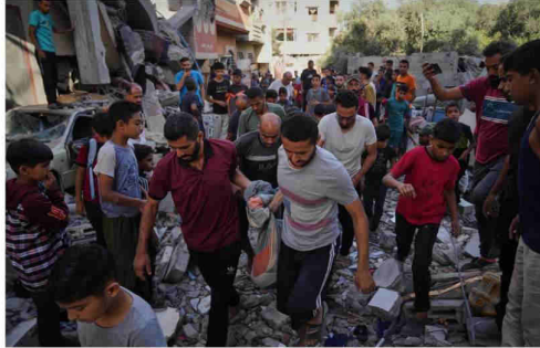
At least 38 killed in Gaza airstrikes, shootings

Netanyahu's words, aimed as much at his increasingly divided domestic audience as the