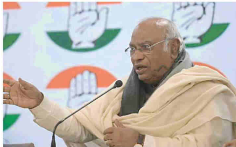
questions. The Election Commission has conspired and has become a puppet of Prime Minister (Narendra Modi) and Home Minister (Amit Shah)," he said.

"The Election Commission is not answering our