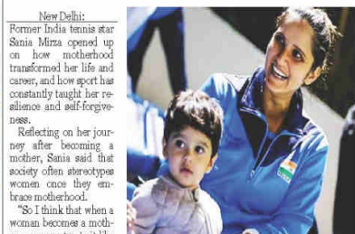
Sania Mirza opens up on motherhood, comebacks & life lessons from sport

had tennis left in me. And obviously, I still had success after coming back as I've learnt about that," she explained.