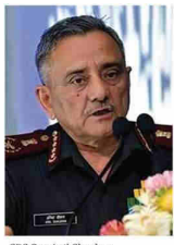
CDS Gen Anil Chauhan

New Delhi The tenure of Chief of Defence Staff General Anil Chauhan has been extended till May 30, 2026. The Ministry of Defence posted on X: "Government has approved the extension of service of General Anil Chauhan as Chief of Defence Staff and Secretary, Department of Military Affairs, up to May 30, 2026, or until further orders, whichever is earlier."