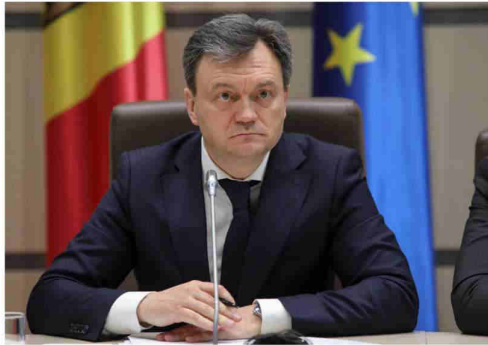
Moldovan PM accuses Russia of meddling in elections to seize power

Brussels agreed to open accession negotiations last year.