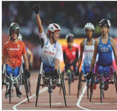
Svayam named official accessibility partner for World Para Athletics Championships 2025

The nine-day competition, hosted in Delhi for the first time, will feature participation from over 2,000 para-athletes from