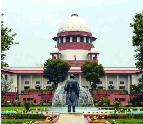
The Supreme Court building in Delhi.

It said even if it was accepted that she was negligent in not being available for medical examination as per prescribed schedule, she deserves to be dealt leniently.