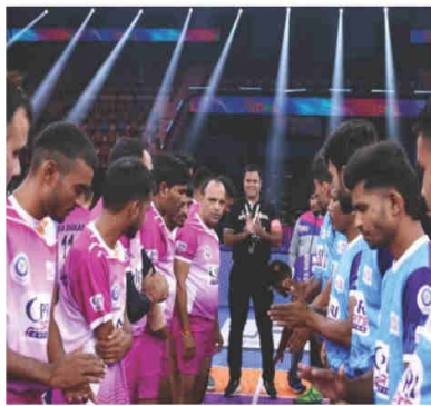
Para athletes light up Jaipur with an inspiring kabaddi exhibition match

Adding to the significance of the day, players from Bengal Warriors of the Pro Kabaddi League were present to cheer the para-athletes, turning the contest into a moving display of sportsmanship