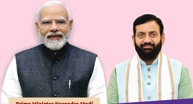
Prime Minister Narendra Modi

Service is the resolve, India First the inspiration...75 years