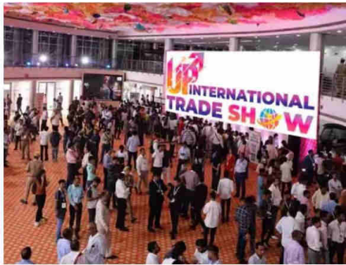
UPITS 2025 to spotlight UP's global edge in trade, culture & innovation

UPITS has grown remarkably in just two years. The inaugural 2023 edition, inaugurated by President Droupadi Murmu, saw 1,914 exhibitors and 400 foreign buyers. The second edition, opened by then Vice President Jagdeep Dhanohar, expanded further with 2,122 exhibitors, 350 foreign buyers, and nearly half a million visitors. Together, these two editions generated export