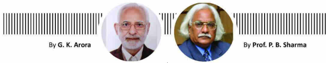
By G. K. Arora

Firstly, the industry has taken a leading role in AI model-building with its share being 90%, whereas academia is deep in high-cited research. Secondly, private investment has soared to unprecedented levels touching $252 billion in 2024, and in generative AI, it particularly shot up, more than 8.5 times over the level achieved in 2022, soaring to almost $34 billion in 2024. Thirdly, models being developed include bigger data sets, getting faster and speedier computationally displaying high performance-levels. NITI Aayog in its Report (2025), further confirms, the supercomputing capacity and algorithmic efficiency are doubling every 8–10 months, and 15–18 months respectively. Fourthly, AI hardware is getting cheaper and energy-efficient, but carbon emissions are on the rise with the average American emitting carbon to the extent of 18 tonnes per year, and GPT-4 emissions reaching at 5184 tonnes in 2023. Both Google and Microsoft have shown heightened concern regarding nuclear reactors supporting their AI activities. Fifthly, in many tasks, the AI Agents are matching human expertise. For limited use cases, ChatGPT has shown better results than Doctors in