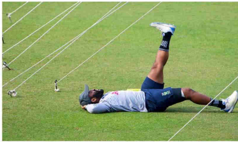
Bavuma sidelined with calf injury, de Kock returns to boost SA white-ball squads

opted to rest most of their all-format players, barring Corbin Bosch and Dewald Brevis, for the white-ball leg of the Pakistan tour. David Miller will captain the T20I squad, while Matthew Breetzke will lead the ODI squad.