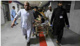
area in Khyber district of Khyber Pakhtunkhwa province, bordering Afghanistan.

The residents, however, claimed that air strikes hit the compound in Tirah Valley's Matur Dara