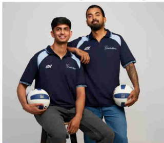
KL Rahul enters volleyball court. Joins Goa Guardians as co-owner in PVL.

The Goa Guardians, debuting in Season 4 this October, will compete alongside top franchises in a high-energy format designed for television and digital audiences. KL Rahul believes Goa's vibrant sporting culture makes it the perfect base to inspire new talent.