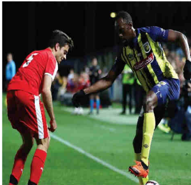
From track to turf! Usain Bolt sets to electrify India with football magic

PUMA India, said "At PUMA, we believe sport has the power to inspire and unite communities. Football is one of the most popular sports among the youth of India, and bringing Usain Bolt -- our global ambassador and one of the