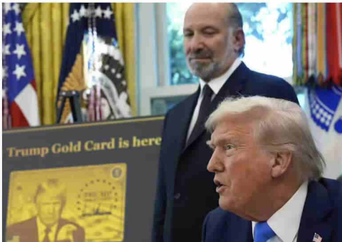
China plays it cool on US H-1B visa hike, highlights its doors are open for global talent

"China welcomes talents from various sectors and fields across the