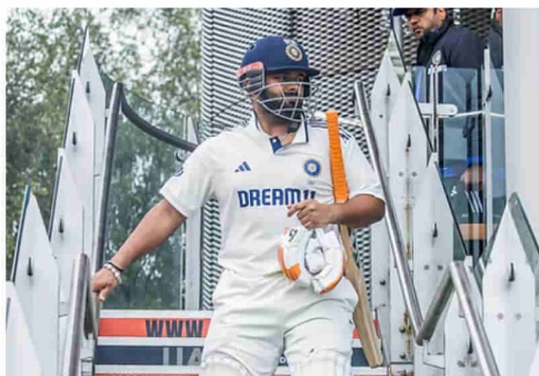
Big blow for Team India: Rishabh Pant set to miss two home Tests vs West Indies

Pant, who served as Test captain Shubman Gill's deputy during the Anderson-Tendulkar Trophy in Eng-