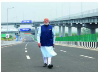
PM took a walkthrough of Dwarka Expressway on the sidelines of the inauguration ceremony of two major National Highway projects - the Delhi section of Dwarka Expressway and Urban Extension Road-II (UER-II) at Rohtak, in New Delhi

New Delhi Prime Minister Narendra Modi on Sunday inaugurated the Delhi section of the Dwarka Expressway and the Urban Extension Road-II (UER-II), worth Rs 11,000 crore, which are aimed at reducing traffic jams in Delhi and its surrounding areas.