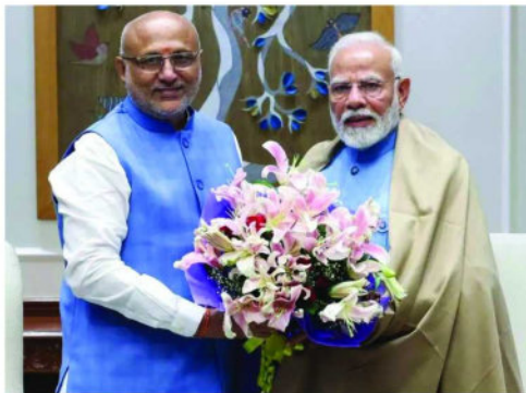
CP Radhakrishnan and PM Modi

spected statesman with nearly four decades of public life, noting that he commands respect across party lines and among different sections of society. He appealed to opposition parties to support his candidature, pointing out that BJP leaders had already