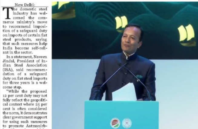
ISA President Naveen Jindal on safeguard duty recommendation

Jindal, who is also the chairman of Jindal Steel, said introducing a safety net through minimum import prices, below which the recommended duty would be triggered, is also a positive move to protect and support the