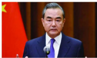
Chinese Foreign Minister Wang Yi

New Delhi Foreign Minister Wang Yi will meet Prime Minister Narendra Modi during his two-day visit to India, beginning Monday, according to the Ministry of External Affairs (MEA).