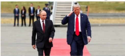
Prime Minister Narendra Modi on Friday announced plans for big bang reforms in the GST regime by Diwali, which will bring down prices of everyday items, as his government looks to overhurd the eight-

Besides, trends in global markets and the trading activity of foreign investors would also impact domestic investors' sentiment.