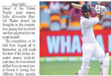
Shardul Thakur ahead of the Duleep Trophy 2025. (File Photo)

New Delhi: Ahead of the Duleep Trophy 2025 season, India all-rounder Shardul Thakur shared his thoughts on the competition, saying that he would use this opportunity to express himself.