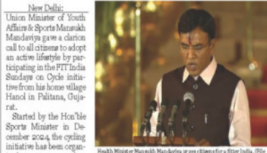
Health Minister Mansukh Mandaviya urges citizens for a fitter India. (File Photo)

New Delhi: Union Minister of Youth Affairs & Sports Mansukh Mandaviya gave a clarion call to all citizens to adopt an active lifestyle by participating in the FIT India Sundays on Cycle initiative from his home village Handi in Palitana, Gujarat.