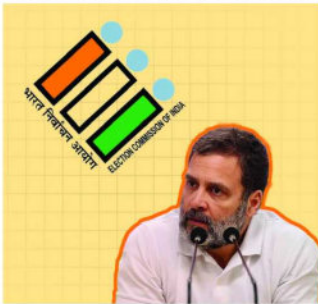
Congress leader Rahul Gandhi

Bihar was a way to steal votes of the people of the state.