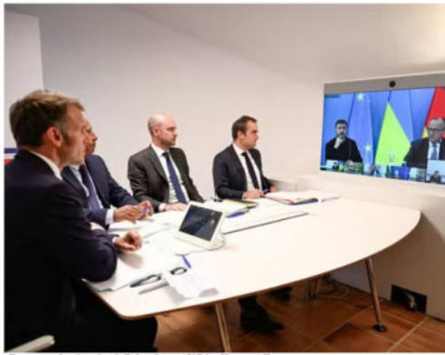
European leaders back Zelensky at White House talks

"The Europeans are very afraid of the Oval Office scene being repeated and so they want to support Mr. Zelensky to the hilt," said retired