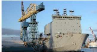
to Japan, plan to meet top shipbuilders from the world's second- and third-largest shipbuilding countries.

Sens Tommy Duckworth, D-Ill, and Andy Kim, D-NJ, who are scheduled to land in Seoul before travelling