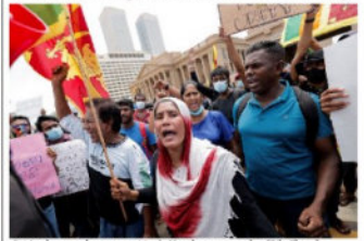
Sri Lanka gov't slams opposition's Monday protest plan (File Photo)

Colombo: Sri Lanka government on Sunday slammed the opposition's plan to stage protests in north and east regions on Monday calling it "political exercise."