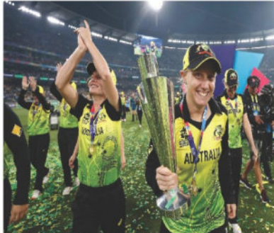
Alyssa Healy during the Australia 'A' series vs India