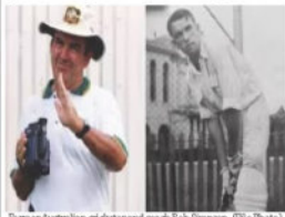
Former Australian cricketer and coach Bob Simpson. (File Photo)

Dubai: The International Cricket Council (ICC) has expressed grief on the demise of former Australia captain Bob Simpson at the age of 89, according to a release from ICC.