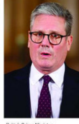
British Prime Minister Keir Starmer

London: British Prime Minister Keir Starmer on Tuesday said the UK will recognise the state of Palestine at the United Nations General Assembly in September unless Israel moves towards a ceasefire in Gaza.