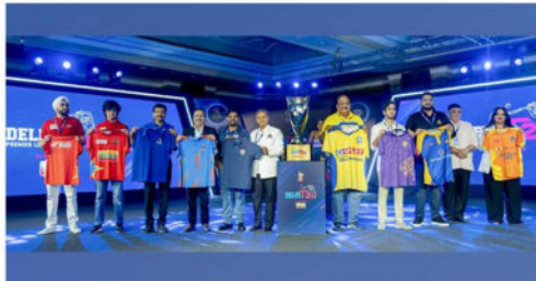
Delhi Premier League to kick off on August 2 -- (FILE PHOTO)

Promising a night of glamour, music, and high-octane energy, the opening ceremony will