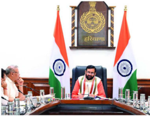
Haryana Chief Minister Sh. Nayab Singh Saini presiding over a review meeting regarding CM Announcements at Chandigarh on July 29, 2025.

In a significant directive aimed at public safety and cleanliness, Saini instructed that a special campaign be launched to make Haryana free of stray cattle. He called upon the Animal Husbandry and Dairy Department to work in coordination with the Urban Local