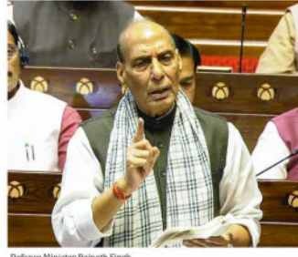
Defence Minister Rajnath Singh

New Delhi: Defence Minister Rajnath Singh on Tuesday said if Pakistan cannot take action against terrorism on its soil, India is ready to help it as Indian forces are capable of fighting terror on the other side of the border as well.