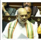
Home Minister Amit Shah

New Delhi: Prime Minister Narendra Modi on Tuesday affirmed that no leader of any country had asked India to stop Operation Sindoor.