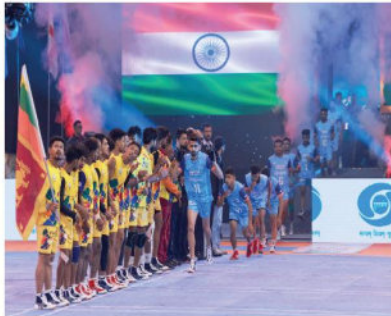
Kho Kho being included in the AIESC's sports calendar.

BESC's sports calendar, players now have increased avenues for stable careers through employment quotas in sports providing further motivation for aspiring athletes to take up the game professionally. Kho Kho is already part of the sporting calendars of the Services Sports Control Board and the Railways Sports Promotion Board.