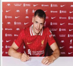
Florian Wirtz (FILE PHOTO)

London: Before the 2025-26 Premier League season, German star Florian Wirtz has officially joined Liverpool. The former Bayer Leverkusen attacking midfielder opened up about his move, sharing his joy, the thought process behind the decision, and a heartfelt message for the fans who had been eagerly waiting for his arrival.