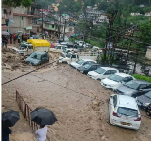
A drain near the jail in Jail Road overflowed with water and mud, sweeping through parked vehicles and engulfing homes. In many houses, debris entered through windows and doors, trapping people inside. At least fifteen individuals were rescued, including two who had to be

Former Chief Minister and Leader of Opposition Jai Ram Thakur has strongly criticized the Himachal Pradesh government's handling of relief operations in the wake of yet another devastating cloudburst in Mandi district. Speaking to the media after visiting the site of destruction at Jail Road in Mandi town, Thakur said the situation has reached a point where accountability must replace political posturing.