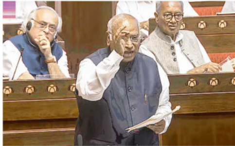
Leader of Opposition in the Rajya Sabha and Congress President Mallikarjun Kharge

Kharge also questioned the silence of Prime Minister Narendra Modi on US President Donald Trump's repeated claims of mediation and brokering a cease-