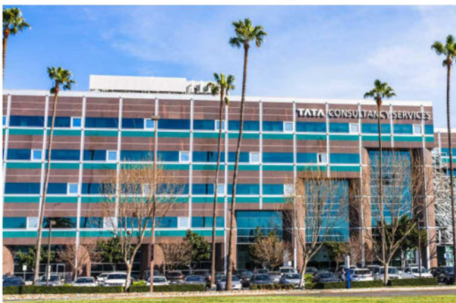
Tata Consultancy Services (FILE PHOTO)

New Delhi: Tata Consultancy Services (TCS) has lost Rs 28,148.72 crore from its market valuation in two days after the company announced that it will lay off about 12,000 employees of its global workforce this year. On Tuesday, the bellwether stock declined 0.73 per cent to settle at Rs 3,056.55 apiece at the BSE. During the day, it dropped 1.23 per cent to Rs 3,041. On the NSE, it dipped 0.72 per cent to Rs 3,057. Shares of TCS had declined nearly 2 per cent on Monday. The stock has lost 2.48 per cent in two trading days. The market capitalisation (mcap) of TCS eroded by Rs 28,148.72 crore to Rs 11,05,886.54 crore in two days. India's largest IT services firm TCS is set to lay off about 2 per cent, or 12,261 employees, of its global workforce this year, with the majority of those impacted belonging to middle and senior grades. As of June 30, 2025, the TCS workforce stood at 6,13,069. It increased its workforce by 5,000