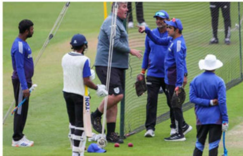
Gambhir had a fierce altercation with Lee regarding the practice facilities. -- (FILE PHOTO)

Lee was quizzed about the entire situation, but he chose to remain tight-