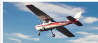
Ottawa: An Indian national has died in a small plane crash near Deer Lake in eastern Canada, the Consulate General of India in Toronto said on Saturday.