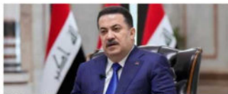
Mohammed Shia al-Sudani (FILE PHOTO)

tween Israel, a US ally, and Iran, and as US struck Iranian nuclear sites. Mohammed Shia al-Sudani said he used a mix of political and military pressure to stop armed groups aligned with Iran from entering the fray. In an exclusive interview with The Associated Press, Al-Sudani explains how he did this, how he plans to keep