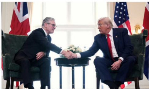
President Donald Trump's administration to step up its role in addressing suffering and starvation in Gaza (FILE PHOTO)

locked out of power in Washington — for the Trump administration to recalibrate its approach after the collapse of ceasefire talks last week. Trump on Monday expressed concern about the worsening humanitarian situation and broke with Israeli Prime Minister Benjamin Netanyahu's claim that people are not starving in