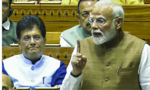
Prime Minister Narendra Modi

New Delhi: Prime Minister Narendra Modi asserted on Tuesday that no world leader had told India to stop Operation Sindoor as he lashed out at the Congress for "importing issues from Pakistan" and said the opposition party is joining terrorists and their masterminds in shedding tears after the victorious Indian military action.