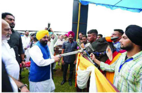
Chief Minister Bhagwant Mann in Mehna Singh Wala village

The chief minister said this law will not only help in preserving indigenous animal breeds in Punjab but also pave the way for resuming bul-