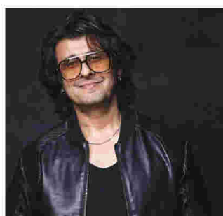
legedly making offensive remarks about the Kannadiga community.