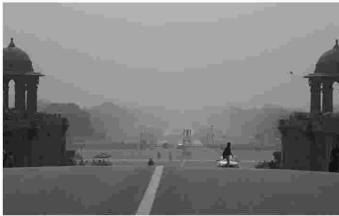
to 30-40 kmph that sped through Punjab, Haryana, Delhi, and north Rajasthan May 14 night to next morning.

The India Meteorological Department said a high north-south pressure gradient over northwest India caused strong dust-raising surface winds gusting up