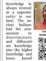
Sadguru Sri Madhusudan Sai

Knowledge is always revered as a supreme entity in our land. The ancient Indians had the rare acumen to discriminate and differentiate knowledge into the higher knowledge and lower knowledge. This was not to demean the value of one knowledge over another, but to emphasise on one over the other, and how we cannot neglect the higher knowledge in pursuit of the lower knowledge. The difference between the two is that the lower knowledge is of the material world and helps us earn a living, while the higher knowledge is to know and attain the supreme state of Divinity. The focus on a robust material life, while neglecting the pursuit of permanent bliss is considered an ignorant way of leading one's life. Hence, all our scriptures repeatedly stressed on acquiring higher knowledge without fail.