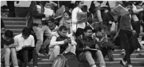
Until now, the labour force survey was released on a quarterly as well as annual basis.

The Ministry of Statistics & Programme Implementation released the first monthly Periodic Labour Force Survey (PLFS) as part of efforts to monitor the proportion of unemployed people among those eligible for jobs in the country in real time.