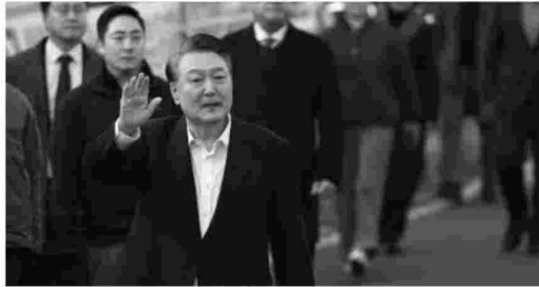
Yoon Suk Yeol was released from prison on Saturday, a day after a Seoul court cancelled his arrest to allow him to stand trial for rebellion without being detained.

In a statement distributed by his lawyers, Yoon said that he "appreciates the courage and decision by the Seoul Central District Court to correct illegality," in an apparent reference to legal disputes over his arrest. He said he also thanks his supporters and asked those who are on hunger