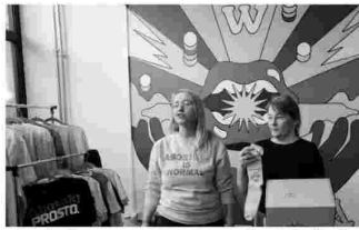
Abortion activists gathered inside for its inauguration. They blasted loud sounds of babies' cries and held huge, gruesome posters.

Opening the centre on International Women's Day across from the legislature was a symbolic challenge to authorities in the traditionally Roman Catholic nation, which has one of Europe's most restrictive