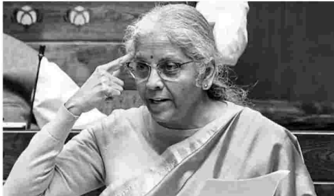
Sitharaman said at The Economic Times Awards. "The minister said that a lot more steps are required to strengthen the country's exports across the board, wherever there is potential."

"In a broad sense, I think, both sides should have ambition for a good treaty, and nobody can fault that. Particularly for India, when you are looking at Viksit Bharat, you need to have good traction. Everybody is concerned about the growth numbers," she