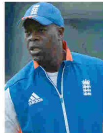
22 at the iconic Eden Gardens. KKR squad for IPL 2025:

The Kolkata Knight Riders will kick off their IPL 2025 campaign against the Royal Challengers Bengaluru on March