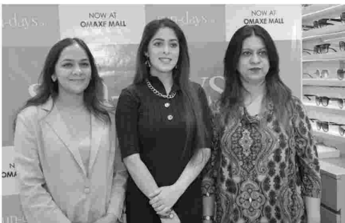
Delhi in Omaxe Chowk, Sun-days Co finds its

New Delhi: Sun-days Co is thrilled to announce the opening of its latest destination at Omaxe Chowk, Chandni Chowk—a perfect blend of luxury and style. Offering a carefully curated selection of over 60 renowned global eyewear brands, Sun-days Co brings to the greater the best in sunglasses, from timeless icons like Ray-Ban, Prada, and Gucci to contemporary trends from Kuboraum and Philipp Plein. It's the ultimate destination for eyewear enthusiasts seeking a blend of elegance and cutting-edge design. Nestled in the heart of