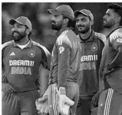
Pakistan reached 200 in 42.3 overs but lost three quick wickets, with Salman Agha (19) and Shaheen Shah Afridi (6) falling in quick succession. Naseem Shah contributed 14 before being dismissed by Kuldeep Yadav. Pakistan were 222/7. Kuldeep Yadav was India's standout performer, claiming 3/40 in his nine overs. He became the latest Indian

Dubai I ndia's bowlers delivered a stellar performance, dismissing Pakistan for 241 in a crucial Group A match of the ICC Champions Trophy in Dubai. After Pakistan opted to bat first, Indian bowlers struck regularly to restrict their opponents. Pakistan's openers, Imam-ul-Haq and Babar Azam, provided a solid start, putting up 41 runs before Hardik Pandya broke the partnership. Imam-ul-Haq soon followed, run out by Asar Patel for 10, leaving Pakistan at 47/2. Babar Azam's 23 off 26 balls, including five boundaries, was a highlight of the innings. Pakistan reached their fifty in 9.4 overs. Saud Shafeel and captain Mohammad Rizwan rebuilt the innings with a crucial 104-run partnership. Shafeel brought up his half-century off 63 balls, while Rizwan scored a patient 46 off 77 deliveries, including three boundaries, before being cleaned up by Asar Patel in the 33rd over, reducing Pakistan to 151/3. Soon after, Shafeel was dismissed for 62 by Pandya, bringing Pakistan to 159/4. Tayyab Tahir failed to make an impact, bowled by Ravindra Jadeja for just 4, causing Pakistan to slip to 165/5.