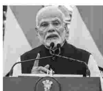
"To become a fit and healthy nation, we have to tackle the problem of obesity. According to a study, today one in every eight people is suffering from the problem of obesity. Obesity cases have doubled in the past few years, but what

New Delhi Prime Minister Narendra Modi, along with India's star javelin thrower Neeraj Chopra and boxer Nikhat Zareen, put light on the disadvantages of obesity, and advised people to reduce the consumption of cooking oil. Addressing the 119th Episode of Mann Ki Baat on Sunday, the Prime Minister highlighted that obesity cases have doubled in the last few years, and the more concerning aspect has been the rise in obesity cases among children. He also advised people to buy 10 per cent less cooking oil, and subsequently reduce the consumption of cooking oil.