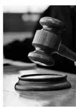
The Supreme Court on Wednesday acquitted a man jailed for over 12 years in a murder case in Kerala.

In its verdict, the bench dealt with the evidence given