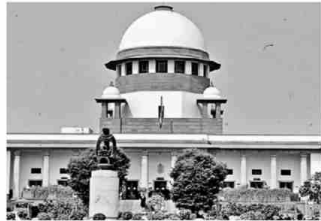
The Supreme Court on Wednesday chided the practice of state governments appointing public prosecutors in high courts on "political considerations" and said favouritism and nepotism compromised merit.

"Judges are human beings and at times they do commit mistakes. The sheer pressure of work at times may lead to such errors. At the same time, the defence counsel as well as the public prosecutor owes a duty to