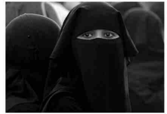
The Supreme Court on Wednesday directed the Centre to furnish data on FIRs and chargesheets against men who invoked instant triple talaq to divorce their wives in violation of the Muslim Women (Protection of Rights in Marriage) Act, 2019.

"I am sure none of the lawyers here are saying that the practice is correct, but what they are saying is whether it can be criminalised."