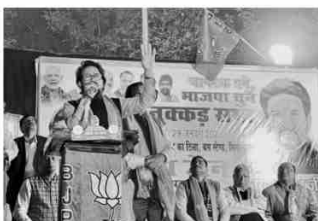
Thakur criticized Arvind Kejriwal and his Aam Aadmi Party for lying to the public and looting Delhi. "If BJP forms a government, women will receive Rs 25,000 per month under the Mahila Samridhi Yojana, along with financial assistance of Rs 21,000 and six nutrition kits to pregnant women under the Chief Minister's Matritva Suraksha Yojana," Anurag Thakur said. The BJP will also form an Auto Driver Welfare Board for auto and taxi drivers, provide life insurance up to 10 lakhs and accident insurance up to five lakhs, and offer scholarships to their children.

Staff Reporter New Delhi Anurag Singh Thakur, former Union Minister and MP from Himachal's Hamirpur Lok Sabha constituency, on Wednesday expressed his commitment to the economic empowerment of women through free water, electricity, and bus travel. Anurag Singh Thakur, while addressing a huge public meeting at Majnu Ka Tila under Chandni Chowk Assembly stated that if BJP forms a government in Delhi, the public will benefit from the implementation of existing schemes.