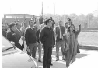
A presentation was given regarding wall cladding and false ceiling in the gallery, which was approved and started immediately. Instructions were given to beautify entry and exit routes, make windows in cabin partitions to allow natural light to enter the office building, and create work stations in various department offices. The Chief Executive Officer directed the completion of the administrative building construction work by March 31.