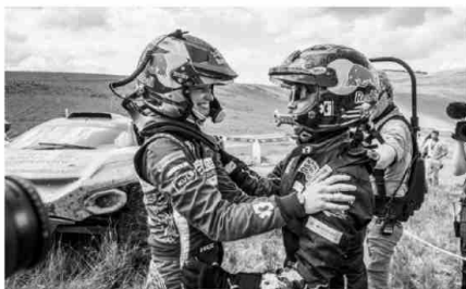
proves just how powerful equal opportunity can be," said 2009 Formula One world champion and Extreme E team owner Jensen Button in a statement.

"Extreme E's mixed-gender format is a game-changer, and this data