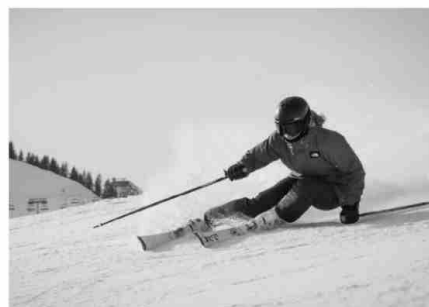
among university students, and increase recognition of Gulmarg as a premier destination for winter sports in India," he said.

"The primary goal of this prestigious event is to promote sportsmanship, enhance participation in winter sports