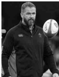
The Lions are set to play nine tour matches in Australia starting in June, including three tests against the Wallabies.