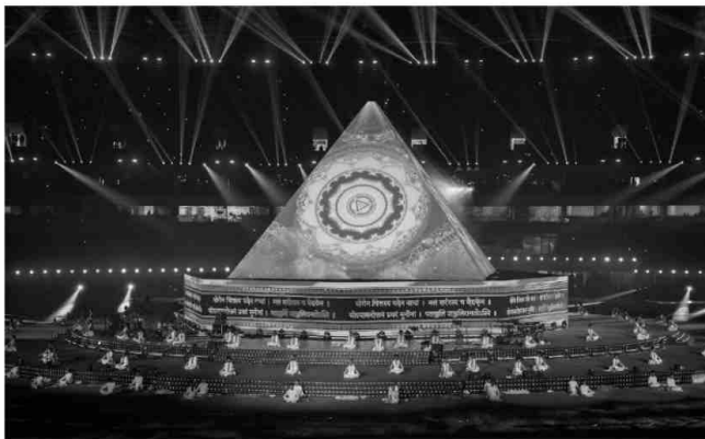
Pushkar Singh Dhami.

Earlier, Modi arrived at the stadium riding on a decked-up golf cart along with Uttarakhand Chief Minister