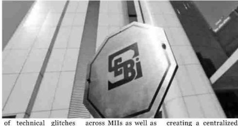
of technical glitches across MIIs as well as creating a centralized

The new portal - Integrated Sebi Portal for Technical Glitches (iSPOT) - is aimed at streamlining the reporting process