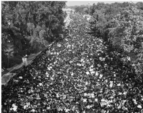
barricaded places to control the crowd.

Sources said the 15 km area of the Sangam region is a jam packed since early morning on Tuesday so much so that there is no place to set foot. Roads and streets are all packed. In the photos taken from drones, pilgrims seemed like crawling. Devotees were forced to walk up to 20 km to take a dip in Sangam which is taking 5-6 hours to reach the ghat. The police have