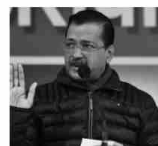
Member of the Congress delegation speaking.

The delegation consisted of Chairman of the Legal