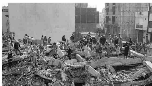
In a statement issued on Monday, the Delhi Police had said it received information about the collapse around 7 pm.