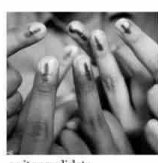
As its candidate.