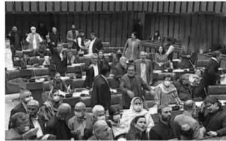
The amendment adds Section 26(A) to the original Peca Act of 2016 to penalise perpetrators

The Prevention of Electronic Crimes (Amendment) Bill 2025 or Peca laws was moved by Minister for Industries and Production Rana Tanveer Hussain, days after its approval by the lower house.