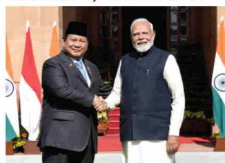
New Delhi HIGHLIGHT

India and Indonesia on Saturday agreed to give a new momentum to the overall bilateral ties and especially concurred on working jointly in the areas of defence manufacturing and supply chains, as Prime Minister Narendra Modi hosted Indonesian President Prabowo Subianto for wide-ranging talks. Subianto, on a three-day visit to India, will be the chief guest at the Republic-Day celebrations at Kartavya Path on Sunday. In his media statement following the talks, Modi described Indonesia as an "important partner" of India in the 10-nation ASEAN bloc as well as in the Indo-Pacific, noting that both countries are