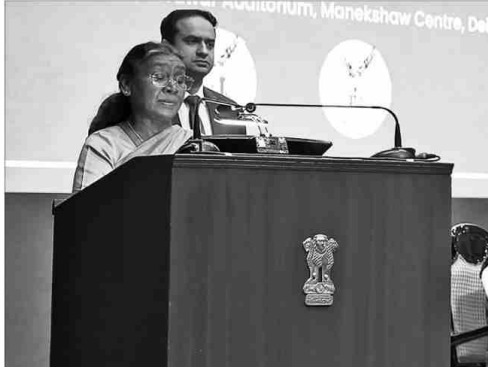
Lok Sabha elections and over 400 Assembly Elections successfully.

The day started with the beloved Motu and Patlu, known for their humour and playful charm cheering with the crowd. Euphoria filled the air with infectious energy. The National Flag was hoisted after the ceremony followed by the kids from FTE School of Round Table