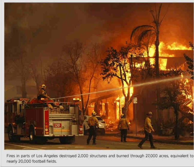
Fires in parts of Los Angeles destroyed 2,000 structures and burned through 27,000 acres, equivalent to nearly 20,000 football fields.