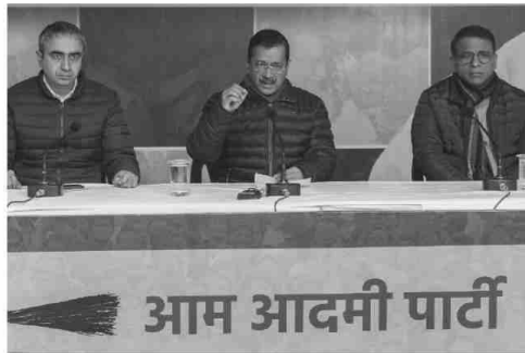
आम आदमी पार्टी

He demanded that a raid must be conducted by the concerned agency, so that it is revealed how much cash is present and his premises. AAP chief also said that the