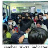
December 16-22 indicates a recent rise in acute respiratory infections, including seasonal influenza, rhinovirus, respiratory syncytial virus (RSV) and human metapneumovirus (HMPV), however, the overall scale and intensity of respiratory infectious diseases in China

"We will continue to monitor the situation closely, validate information and update accordingly," the sources said, following recent reports of an outbreak of the human metapneumovirus (HMPV) in China.