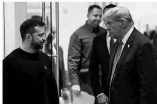
Trump's strength unpredictability can help end the war in Ukraine: Zelenskyy

However, Zelenskyy said it won't be possible to end the almost three years of war in one day, as Trump claimed during his election cam-