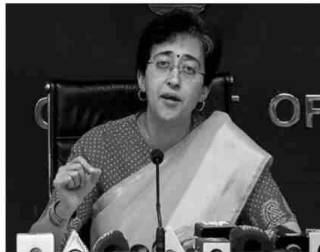
Delhi Chief Minister Atishi speaking at the event.

The newly inaugurated block includes 45 rooms, with 25 classrooms and six advanced laboratories equipped with modern tools, including three types of microscopes. These facilities aim to enable students to study subjects like biology more thoroughly and pursue careers in fields