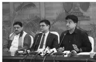
Chandra explained that due to the absence of a tariff order, the truing up of accounts has not taken place.

Chahal assured the consumers that NDMC will not allow any increase in electricity bills, despite the DERC's order. Currently, there are approximately 55,000 power connections in NDMC areas, with more than 60% being domestic consumers.