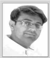
By Dr Satyavan Saurabh

Sustained outflows after the September 2024 stock peak weakened the rupee as investors moved to safer assets amid speculation of a rise in US interest rates. Trade deficits, such as the high trade deficit, highlight external dependence on imports, especially for energy, widening the current account deficit during rupee weakness. India's oil import bill rose with the rupee depreciation, widening the 2024 trade deficit to close to $75 billion.