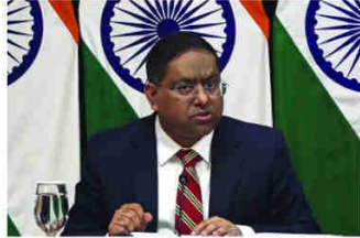
Territory of Ladakh and New Delhi's consistent position regarding its sovereignty.