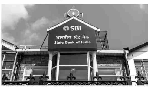
Har Ghar Lakhpati & SBI Patrons