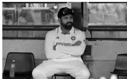
England from June 18-22 in Leeds.

So, is there a way forward for Rohit, the Test cricketer? Unfortunately, the next Test match that India will play if they don't qualify for the World Test Championship (WTC) final is against