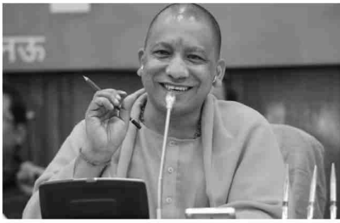
Chief Minister Yogi Adityanath

Highlighting the critical importance of clean water, he recalled that between 1977 and 2017, polluted water and unhygienic conditions caused diseases like encephalitis and vector-borne illnesses, leading to the tragic deaths of 50,000 children in eastern Uttar Pradesh, including Gorakhpur.