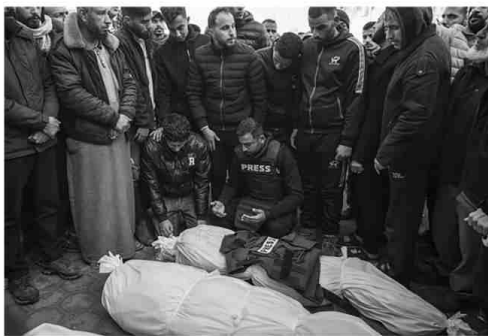
Hamas gathering points and command centres throughout Gaza. The army asserted that measures were taken to mitigate civilian harm, such as using aerial surveillance.

The Israeli army said in a statement on Friday that during the past day, it had struck dozens of