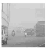
worsening of the situation.

Stage 3 also bans non-essential diesel-operated medium goods vehicles with BS-IV or older standards in Delhi.