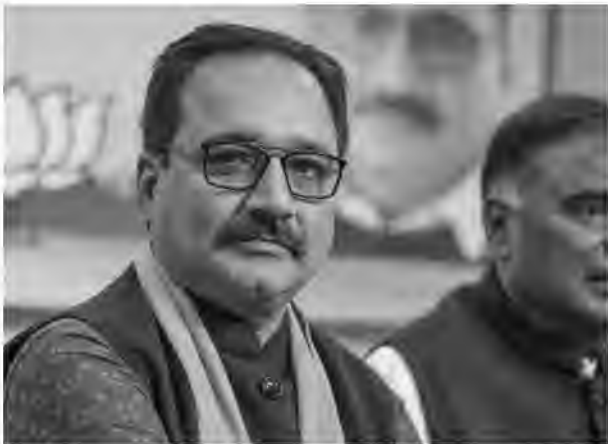
reaction from the Delhi government or the Aam Aadmi Party (AAP).