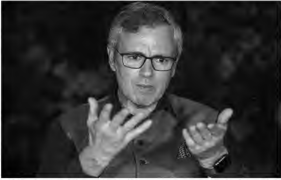
table development of all regions and sub-regions of Jammu and Kashmir have remained the buzzword of the political agenda of the National Conference, Abdullah said.

During the interactive session, the party functionaries gave a detailed account of the ongoing political activities in their respective seg-