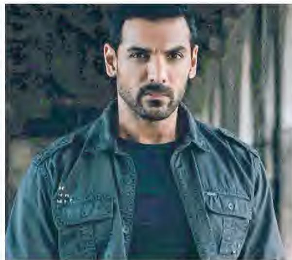
@thejohnabraham. Watch our clash in theatres on 25th Jan in #Pathaan! Releasing in Hindi, Tamil & Telugu."

In the new still, John who turned 50 today looked intense in all-black attire. The post read, "On-screen foe, off-screen buddy... Happy Birthday dearest