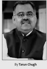
By Tarun Chugh

The day of April 13, 1919. The national movement against the British colonial rulers was in full swing. Leaders like Dr. Saifuddin Kitchlew, Satyapal, who opposed the Rowlatt Act brought by the British government, were arrested and exiled from the country. Rejecting this, the movement of the people of the country intensified. Protests also started in Amritsar in Punjab state. The British government banned protests with a ban on public gatherings. At the same time, thousands of people gathered in the seven-acre garden on the occasion of Vaisakhi, an important festival of Punjabis. Among them were Sikhs, Hindus, and Muslims. An officer accompanying the British army closed the entrance and issued orders to attack the unarmed crowd. A total of 50 soldiers fired 1,650 rounds of bullets in 10 minutes. In an attempt to save their lives from the rain and stampede of those bullets, many people jumped into the nearby well, due to which many lost their lives. The name of that garden of living proof of inhuman genocide is 'Jallianwala Bagh'. General Dyer was the name of the monster who attacked indiscriminately on the hands in an inhuman way.