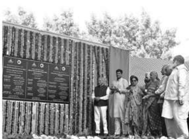
as a tribute to the freedom fighter.

During his 'Mann Ki Baat' radio broadcast on Sunday, PM Modi had announced that the airport would be renamed after Bhagat Singh