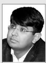
By Satyavan Saurabh

There is an increasing trend of cardiovascular problems among the young population today. Heart attacks and other heart diseases have always been major health issues around the world. According to experts, many factors are responsible for heart attacks, including diabetes, and blood pressure, lifestyle factors such as smoking, drinking alcohol, and an unhealthy diet, as well as excessive stress which makes the heart sick and leads to cardiovascular problems. Makes it hypersensitive. There is also an increasing trend in diseases like diabetes, hypertension, obesity, etc. in the younger age population.