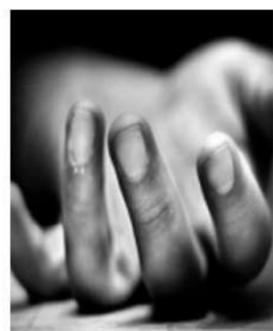
deceased's family after an autopsy, they said

The body has been kept at a mortuary and will be handed over to the