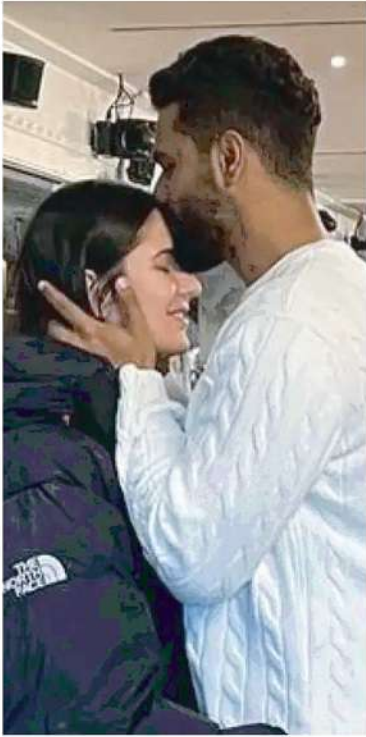
Katrina Kaif shares a beautiful love note for husband Vicky Kaushal this Valentine's Day

Mumbai Newly weds Katrina Kaif and Vicky Kaushal are ensuring they have a memorable Valentine's Day. Katrina took to Instagram to share mushy pictures and a love note for husband Vicky. The actress posted, "We may not have been able to have the romantic dinners this year, but we make the difficult moments better and that's what matters." While Vicky is seen dressed in a white cardigan and pants, Kat is seen in a black jacket. In the first picture the couple is seen lovingly gazing at each other. In the second they share a hug and Vicky seals it with a kiss on the forehead in the third photo. Friends and colleagues were quick to drop in heart emojis and cheer for the couple.