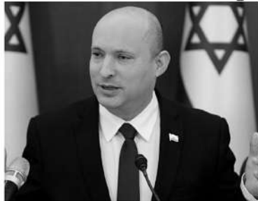
launched missile strikes against the UAE. Israel has stepped up its naval presence in the Red Sea, a criti-

and economic issues, with an emphasis on technology and innovation." Overhauling Bennett's trip to Bahrain are rising regional tensions. The US and Israel have accused Iran of attacking commercial shipping in the Gulf, and Iran-backed Houthi rebels in Yemen have recently